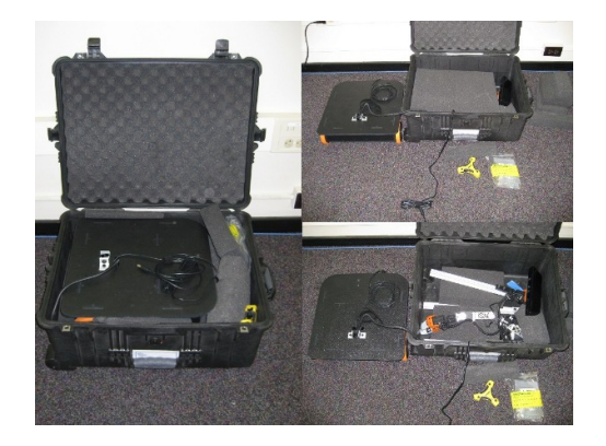
Figure 2: Maxwell, disassembled for shipment and packed in a Pelican case.