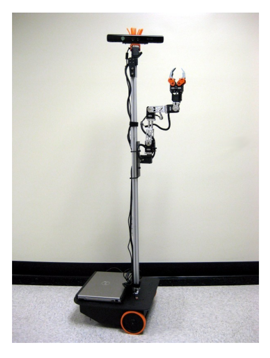
Figure 1: Maxwell, a human-scale mobile manipulator.

is large and bulky to move about, we designed Maxwell such that he could be quickly broken down into several sections for easy transport. This is especially important should the robot be entered in any of the many competitions and benchmarks which require travel, such as the ICRA or AAAI mobile manipulation challenges, or the international RoboCup@Home contest.